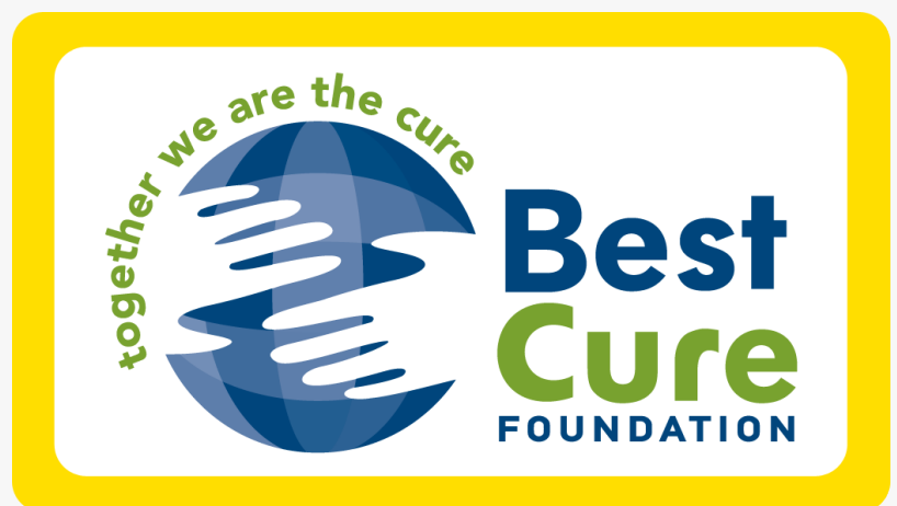
Best Cure Foundation — www.bestcure.md